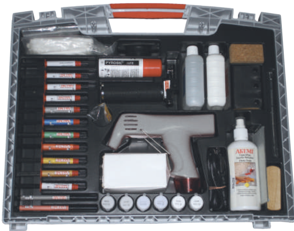
AKELUX STONE REPAIR SYSTEM PRO